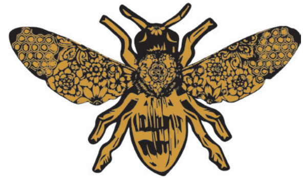
RUDOLF STEINER SCHOOL OF ANN ARBOR

It has served Waldorf teachers ever since, as a way of staying true to the values of Waldorf education while adapting to needed change. With the power of imagination, a deep well of courage and a sense of responsibility to community, RSSAA recognizes that our role as educators is to provide joy, connection, and hope in these changing times.